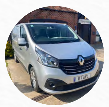
Our private ambulance