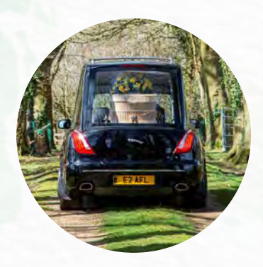
The use of our hearse is included in our professional fee.