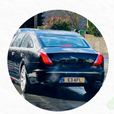
If you would like family members to be transported to the funeral in our limousine, this is an extra cost. The driver will take you to the funeral venue and wait to take you on to the wake venue afterwards.