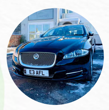
Our Jaguar limousine